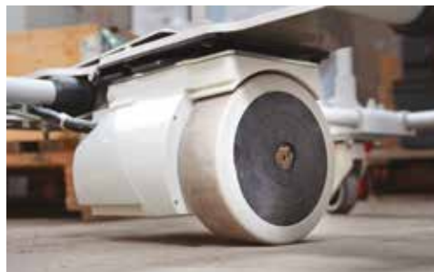
EW9Z-1MCS2 on AWD® 160 wheel

✓ Suitable for heavier loads, between 500 and 1000 kg.