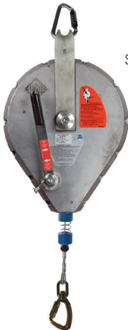
SRLR STU A S 65 STA

Please note: The winch is only for rescue. For general hoisting purposes with material loads, or with persons, winches are needed with dedicated certifications.