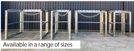
Available in a range of sizes