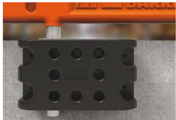
Galvanised steel posts