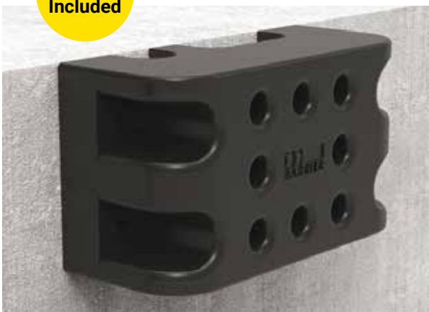
DSR1 Dock-Safe receiver