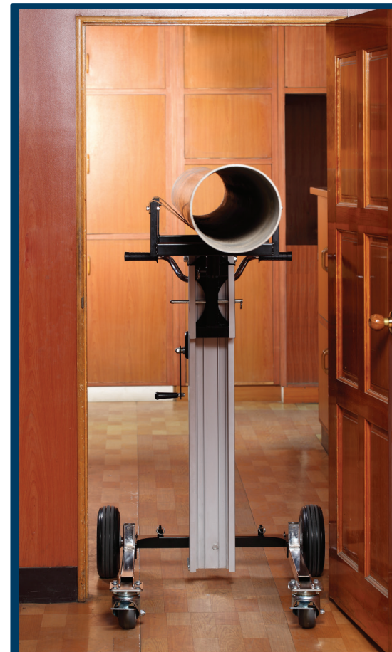
Doorway access 90° product swing to allow slim, easy access through 77cm doorways.