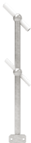
BFTP-S45L Through post 45° angle – left side mount