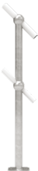
BFTP-SM45 Through post 45° angle – surface mount