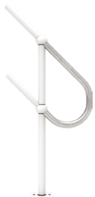
BFCB45 Closure bend 45° angle