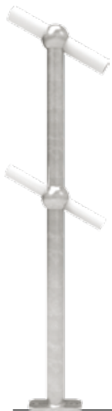
BFTP-SM30 Through post 30° angle – surface mount