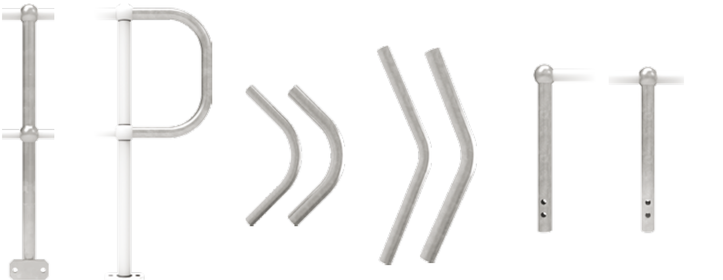
BFTP-S90 Through post – side mount