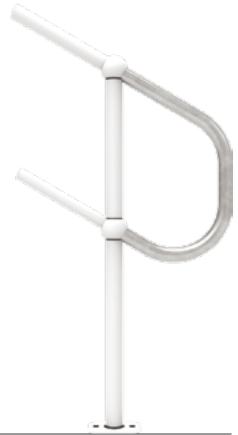
BFCB30 Closure bend 30° angle