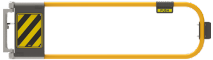
BFSG Ball Fence Swing Gate

90mm surface mount bollard – HDG (gate fixings supplied)