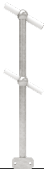
BFTP-S30L Through post 30° angle – left side mount