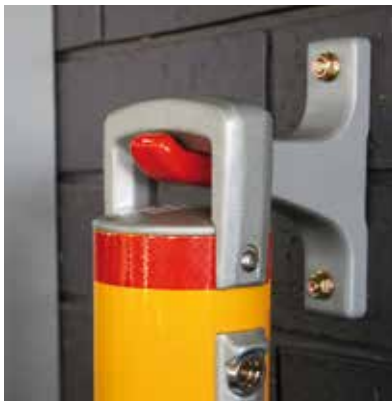
5 Hanging holder

Finish: Hot Dip Galvanised (HDG) only/and Powder Coated (PC), or 316 Stainless Steel (SS) only/and Aluminium cap with handle (H).