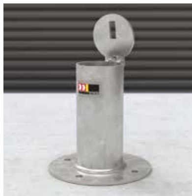
6 Surface mount holder