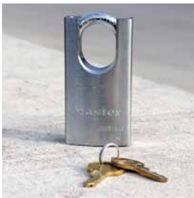
7 Shielded padlock