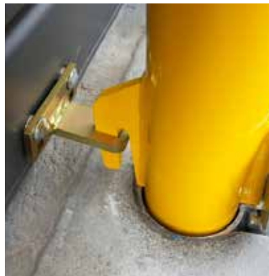
1 Roller door bracket