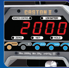
1.2" LED display